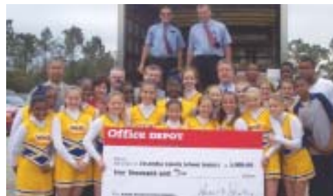
To help communities along the Gulf of Mexico recover from the destruction wreaked by Hurricane Ivan, Office Depot made contributions to the school systems in Baldwin County, Ala. (left), and Escambia County, Fla.