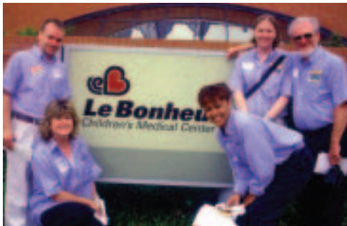
Several employees from Memphis, Tenn., area stores participated in the LeBonheur Methodist Children's Medical Center radiothon on September 3 in conjunction with local radio station 98.1 The Cat. The Office Depot group staffed the phones for the entire afternoon. Overall the radiothon raised $250,000 during the five-day event.