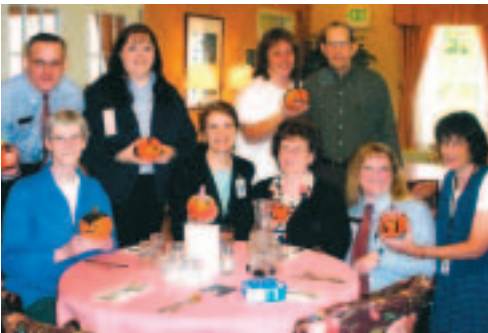
The team at Store 531 in Clarksville, Tenn., shared the fruits of their Celebrity Pumpkin deliveries with seniors at the Walking Horse Retirement Center.