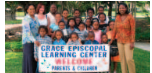
Office Depot donated backpacks to the Inner City Youth Golfers organization and Grace Episcopal Learning Center in West Palm Beach, Fla.