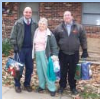
The team at Store 2203 in Danville, Ky., showed their commitment to the community at the holidays by donating 60 bags filled with gifts to area senior citizens.