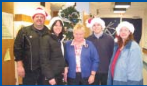
In Saskatoon, Saskatchewan, after Store 716 won the Shrink Tips contest for the fifth year in a row, the employees chose to donate a portion of their winnings back to the community. Deciding that the worst thing that could happen at Christmas was to have a loved one in the hospital, they purchased gifts for the children in the Pediatrics Ward at the Royal University Hospital.